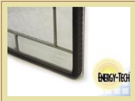
Energy-Tech Triple Pane Leaded Glass Window

a group of leaded glass craftsmen apply their unique skills to produce the highest quality leaded glass windows in the market. The construction of leaded glass windows has always been a time-consuming process. By utilizing the latest advances in chemistry and assembly technologies, Masterpiece has the capability of fabricating an average of 1,000 windows per day with flawless precision. Lead lines are 5/32" and absolutely symmetrical. You will never see unsightly tape overlays or blurry fill-ins in a Masterpiece window. Where most leaded glass facilities require a three month turnaround, we are able to deliver in a mere three weeks or less — at a lesser cost.